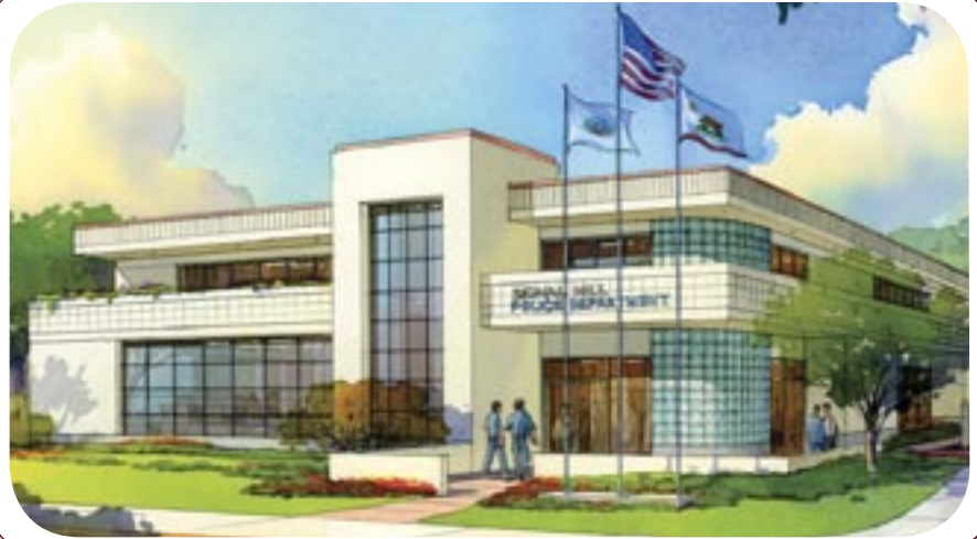
Artist's rendering of proposed Police Station

O n November 8, 2005, Signal Hill voters will be asked to decide whether to impose a tax of 3% on charges for electric, gas, water and other utility services (with exemptions for seniors and low income households) for a period of no more than 15 years. The money generated will be used to finance and construct a new, modernized police station in the City of Signal Hill and to pay for police equipment and other related costs. If you would like to schedule a tour of the Signal Hill Police Department, please contact Captain Tom Sonoff at (562) 989-7205. Reminder: The last day to register to vote is October 24. Voter registration forms are available at City Hall, 2175 Cherry Avenue. The last day to request an Absentee Ballot is November 1.