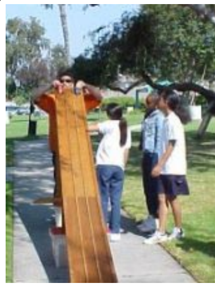
Signal Hill Elementary School students prepare to race their derby cars.