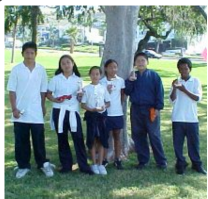
Signal Hill Elementary School students with their trophies for best design and fastest car in the derby car race.

The Signal Hill Police Department, in conjunction with the Long Beach Unified School District, presented the “Too Good For Drugs” educational program to the City’s 4 th and 5 th grade students. The 10-week program, designed to educate students regarding the dangers involved in the use of drugs and alcohol, concluded with a graduation party, including a derby car race.