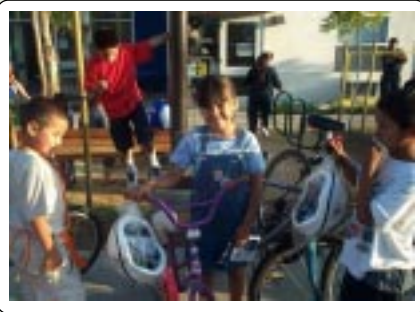
Lucky winners show off the bicycles and helmets won at “National Night Out.” The bicycles were provided by the Signal Hill Police Department and the helmets were donated by the Knights of Pythias

The Signal Hill Police Department hosted its first annual “National Night Out” on August 3, 2004. “National Night Out”, a nationwide event with over 10,000 communities participating, promotes police-community partnership, crime prevention and neighborhood unity. The event was held at the new Las Brisas community center with a variety of public service organizations and local businesses participating.