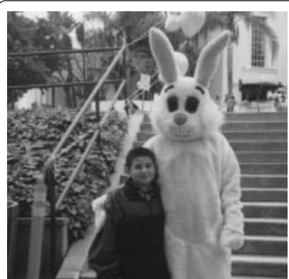
Join our bunny as he springs

into action at the annual Spring Eggstravaganza Hunt, on Saturday, April 19 th , beginning at 10 a.m. Parents and children will enjoy a spring morning hunting for eggs and candy in the safe environment of Signal Hill Park. Remember to bring a basket to collect all the goodies. Photos with the Easter Bunny will be available immediately following the egg hunt for only $3. Please note: inclement weather will cancel the egg hunt. For more information, please call 989-7330.